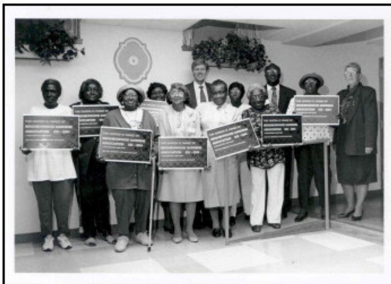
From the dedication of Point Breeze Gardens in 1995

This spring, NGA is actively working on a dozen new garden acquisitions while continuing to support the 25 gardens currently in the land trust with funding for physical improvements. Several new fencing projects will be completed this season making these gardens even more attractive assets in their neighborhoods. Thanks go to all of our partners -- foundations, individual donors, community gardeners, and corporations.