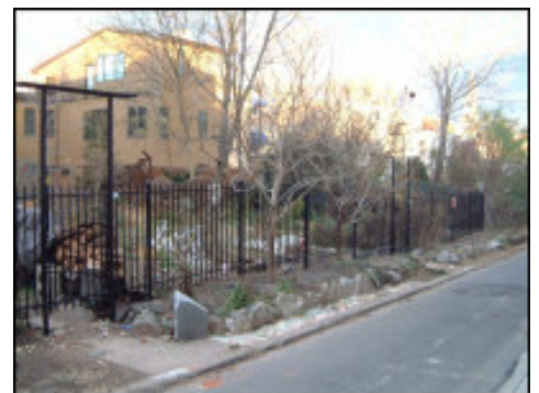
Seedy Acres new fence

NGA continues with the fourth year of the Garden Improvement Project. Since 2002, the City's Office of Housing and Neighborhood Revitalization has awarded NGA with an annual $25,000 grant to make major physical improvements to older gardens in the land trust. This grant must be matched dollar-for-dollar by private donations. Planned improvements for 2005 include: new fencing, streetscape improvements, tool storage facilities, and installing electrical service at gardens.